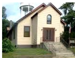
Our Savior Polish National Catholic Church